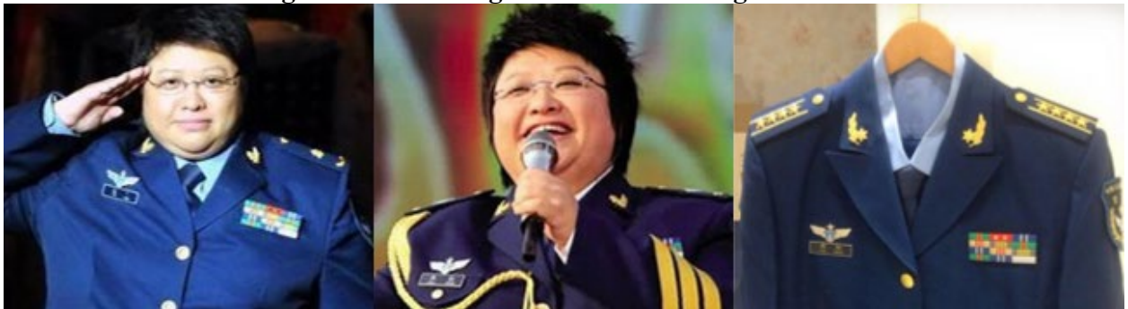
Figure 7: Han Hong Uniforms and Insignia

Whereas regular members of the Song and Dance Troupe were all civilian cadre, all of the leaders, including the commanders (团长), political commissars (政委), and deputy commanders (副团长), were special technical officers and wore their appropriate ranks since ranks were reinstated in 1988. 209 The only senior female leader identified was Han Hong (韩红), who was born in 1971, and is a special case. In September 2009, she was recruited directly (特招入伍) into the PLAAF as one of the deputy commanders (副团长) and served as a special technical officer (技术军官) with the rank of Senior Colonel (大校) as shown in Figure 7 below. 210 Based on limited information, it appears that no female was ever the commander of the Song and Dance Troupe (团长). Figure 7 below shows Han Hong wearing the special uniform and collar insignia and her uniform on the right shows her special technical officer rank and the ribbons show her grade as division leader.