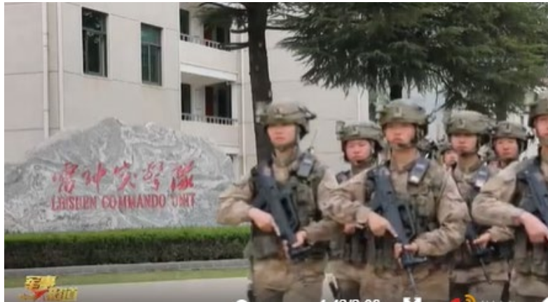
Figure 3: Leishen Commando Unit Female Team 178

College to exchange views and become familiar with the college's training and facilities. 177 Although these exercises are often billed as “anti-terrorism” drills, the content of the exercises often suggests that the units involved are practicing skills closer to combat activities, and this is how they are coded in the data presented in this study. It is not clear if any females participated in any of the overseas exercises, but they most likely participated in the events held in China.