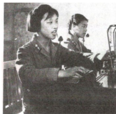
"Red No.1 Desk " of the PLAAF General Communication Station in 1960s

This section provides an overview of the communications structure and how females have fit into it. 115 One of the most important points is that females have always served as the core of the communications structure. Although some enlisted force males have served in communications organizations, the majority of the organizations discussed below are all-female organizations. Only a few mixed male and female organizations have been noted. 116 Although female officer and enlisted personnel form the core of the communications structure at the bottom, it appears that males dominate the command structure at the top. For example, no information was found concerning a female commander or deputy commander at the regiment or brigade level or any director, deputy director, or staff officer in any of the PLAAF or TCAF communications-related organizations; however, that does not mean they do not exist.