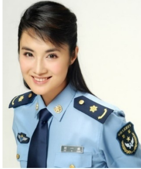
Figure 4: Song and Dance Troupe Civilian Cadre

Adding further complexity, members of the Song and Dance Troupe appeared to wear special uniforms with unique shoulder insignia as shown in Figure 5 below. 207