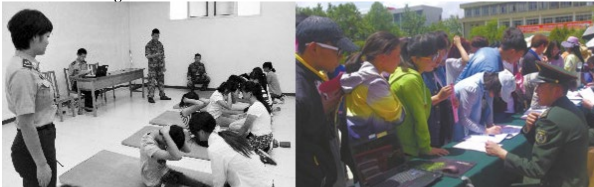
Figure 2: Female Enlisted Member Recruitment Photos

The photo on the left in Figure 2 below shows female students taking part in the physical examination. 40 The photo on the right shows personnel from a People's Armed Forces Department (PAFD/人武部/人民武装部), which is responsible for conscripting and recruiting enlisted personnel at the provincial and below levels as well as managing college student recruitment, who are conducting in-person registration for male and female college/university students and upcoming graduates. 41