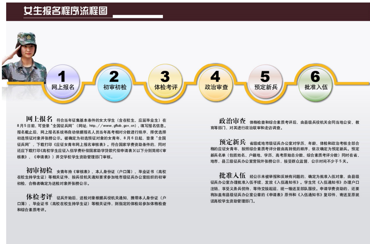
Figure 1: Female Enlisted Member Registration Process

At a basic level, the female registration (报名) process shown in Figure 1 below, which includes online and in-person registration, is similar to that of male applicants, but it has a couple of minor differences. 39